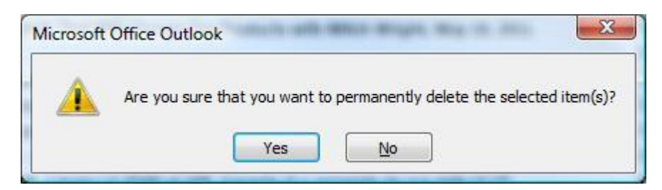
Figure 1. A confirmation dialog box.

We've all done it. You select some irreversible action, get presented with a dialog box asking you to confirm your decision, click OK, and only then realize that you've made a mistake. Figure 1 shows the dialog box you get when attempting to delete an item from Outlook's Deleted Items folder. Once you click Yes, it's too late. The item is gone.