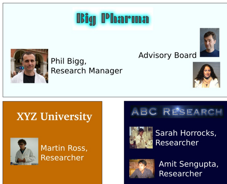
Figure 2: Team members in our example scenario, the UTS-Alpha project

This report makes use of a scenario to demonstrate the idea of the marketplace. In this scenario, Phil Bigg - a project manager in Big Pharma Corp - has created a new content space for the UTS-Alpha project. Some time has now passed and the Content Space has seen some use. The site colleagues dashlet shows that the users invited by Phil Bigg have accepted their invitations and are now members. There are now items visible in the recently modified documents dashlet, and another dashlet shows some recent activity across the entire site.