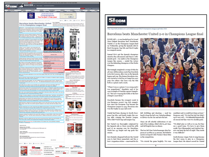
Figure 1: An example Web article with bounding rectangles of text segments (left), our Printout of the extracted article text, title and image (right).

DocEng '09, September 16–18, 2009, Munich, Germany. Copyright 2009 ACM 978-1-60558-575-8/09/09 ...$5.00.