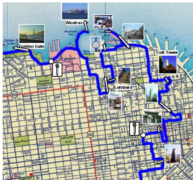
Fig. 1. Map-based view of path-enhanced media for a trip through San Francisco. Path is in blue, with icons indicating captured media, and arrows indicating capture device location and orientation.

We believe that path data - that is, the route in space and time traveled by the capturer of the media - provides a wealth of contextual information that links isolated media files, facilitates the creation and telling of stories from collections of media, and provides novel