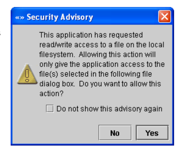
Figure 1. "May I?" request from Java Web Start.

A common means of dealing with this problem is sandboxing , which involves setting up a set of rules for each program, as in Java 2 Security [10]. A failing of sandboxing is that the rules are static. Adding authorities to a running program, such as to open a file, is often difficult in such systems. The alternative is to control access to individual resources, but to date such systems have been too hard to use. Many such applications constantly nag the user with "May I?" dialog boxes, such as one from Java Web Start [11] shown in Figure 1.