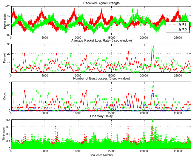
Fig. 2. Performance statistics for 15-minute packet trace, where + and o indicate AP1 and AP2. Received packet signal strength (top plot), average packet loss rate (second), number of loss events of burst length \geq 2 (third), and one-way delay (bottom), all as a function of packet sequence number. In the second and third plots, each point represents an interval of 150 packets (5 secs). In the third plot \nabla indicates Balanced .

We next examine the application-layer performance in terms of reconstructed video quality. Video sequences are compressed using JM 2.0 of the emerging H.264/MPEG-4 AVC video compression standard and are appropriately framed into packets which are sent as RTP/UDP/IP. We use four standard video test sequences in QCIF format: Foreman , Claire , Mother-Daughter , and Salesman . Each has 300 frames at 30 frames/s, and is coded with a constant quantization level. The average PSNR and the bit rate for each sequence are given in the column headings of Table 2. The first frame of each sequence is coded as an I-frame, and all subsequent frames are coded as P-frames. To improve error-resilience, a slice in every 4 th frame is intra updated, corresponding to an intra update every N = 4 \times 9 = 36 frames. Both the packet framing and the intra update are as recommended in JM 2.0. Each