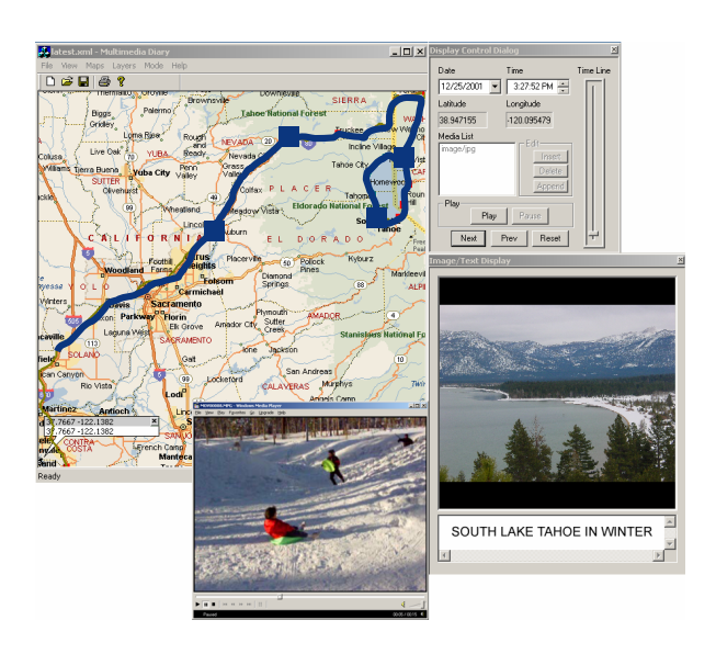
Fig. 1 . A screen shot of the PathMarker viewer and editor showing four windows, from top left in clockwise order: 1) interactive map view of path and media icons 2) control window 3) still image window with text annotation and 4) video and/or audio media player window.

display, the partial path already traveled and the media already viewed are shown in bold. The map overlay window allows the selection of different map backgrounds and different "layers" of media organized into different categories. This window shows the traversal of the path during playback of the trip, and it also allows random access interaction with the trip content using mouse clicks on the path or on the media icons. The top right window shows the control window, displaying date, time and position information and information about the media being viewed. The control window contains controls such as "play" that allow viewing the entire trip, including retracing portions of the path taken, the viewing of the photos, videos and other media at the appropriate positions and the continuation of the path retracing between media elements. In addition, the control window, together with the map-overlay window allow the selection of media to insert or delete during editing. The lower right window shows a still image viewer, together with a text annotation viewer. In the figure the text "South Lake Tahoe in Winter" is seen below a digital image of the lake. The lower center window is a media viewer, showing a frame from a video of a child sledding in snow.