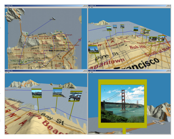
Fig. 2 . Four views of a PEM flyby with a city map texture-mapped on a Digital Elevation Model background. The figure shows a simplified path traveled together with bill-board representation of the digital media.

background a conventional city map texture mapped on a three-dimensional elevation model of the region. The "billboards" in the figure show media content that correspond to photos, videos, etc. at the locations they were taken. The viewer's location and view direction in a 3D world are either interactively controlled or automatically provided through preset flybys.