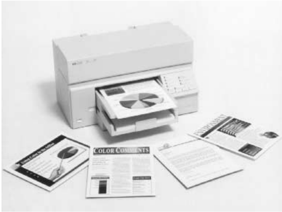
Fig. 1. The HP DeskJet 1200C and 1200C/PS printers are 600-by-300-dpi black and color inkjet printers for office applications.

units. In addition, new aggressive tooling strategies shaved months from the traditional tooling cycle times. Finally, early supplier involvement, including early interaction of HP production people with all the design aspects of the product ensured rapid convergence of all manufacturing issues. As a result of this streamlined development process, the laboratory phase of the development cycle for the HP DeskJet 1200C printer was completed in the shortest time in the division's history.